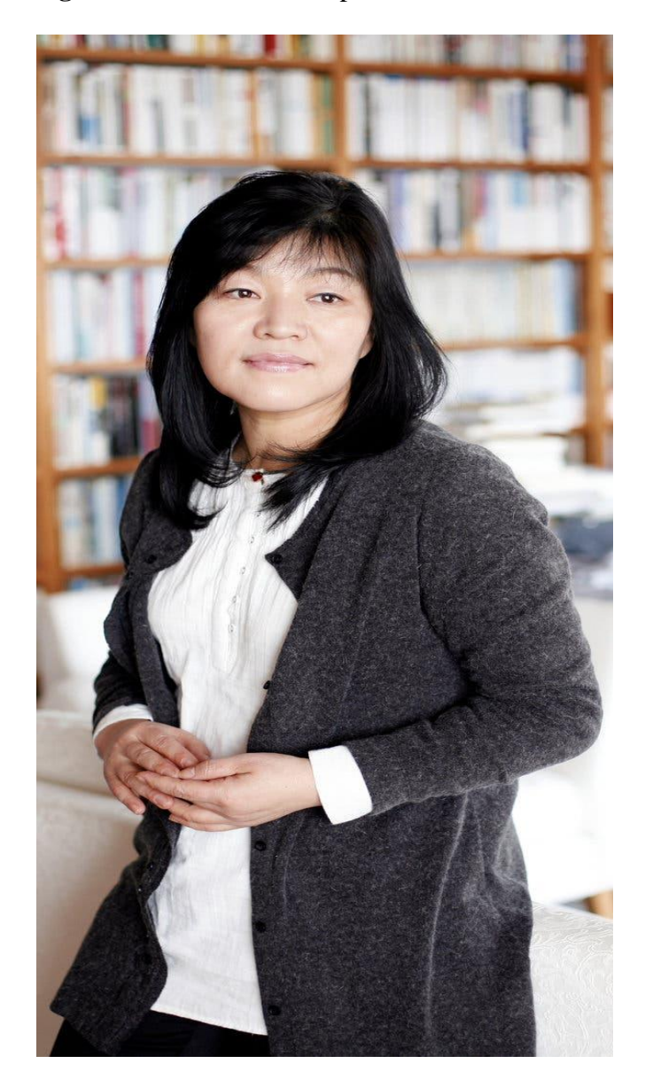
Figure 1: Kyung Sook shin the writer South Korean writer of Please look after Mom , when her book was first published in Korean language in 2008, then translated to English in 2019.

https://ieas.berkeley.edu/sites/default/files/cks_program_20141024_shinkyungsook.pdf