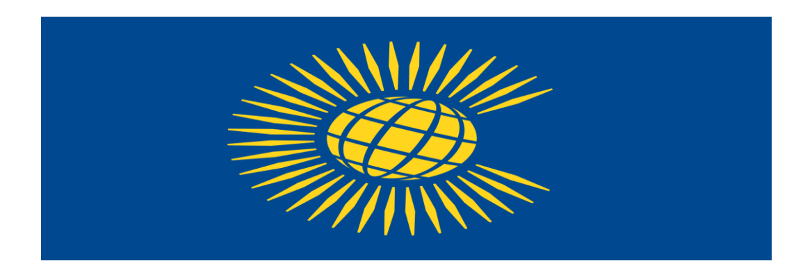
Figure 2.1 a flag of commonwealth of nations

Governments of the United Kingdom, Canada, Australia, New Zealand, South Africa, India, Pakistan, and Ceylon, whose countries are united as members of the British Commonwealth of Nations," in order to accommodate constitutional changes in India. ("British Commonwealth of Nations para 3,4)