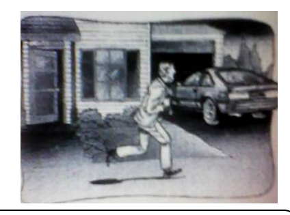
Figure 1.2: Pictures for Story-Telling Activities (as qtd in Harmer, 1989, p. 88-89)

The group have to memorize everything can about the picture -who's in them, what's happening, etc. They can the talk about the detail in their groups.