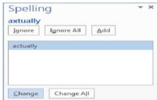
Figure: 2.2: Correcting spelling mistakes