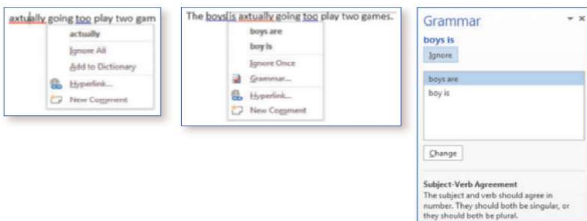
Figure: 2.1: Correcting grammar mistakes

VanHuss and others (2013) explained that the word processor underlines words and expressions with red and blue colors. The Red color indicates spelling errors while the blue one shows grammatical errors. (p. 107). For example, when student makes spelling mistake, the word processor automatically underlines the mistake with red color in order to show it to the writer. In this case, the student can press on the underlined mistake. As result, a window contains several correct suggestions will be exhibited. Therefore, student can choose one of these correct options. See figure 2.1 and 2.2