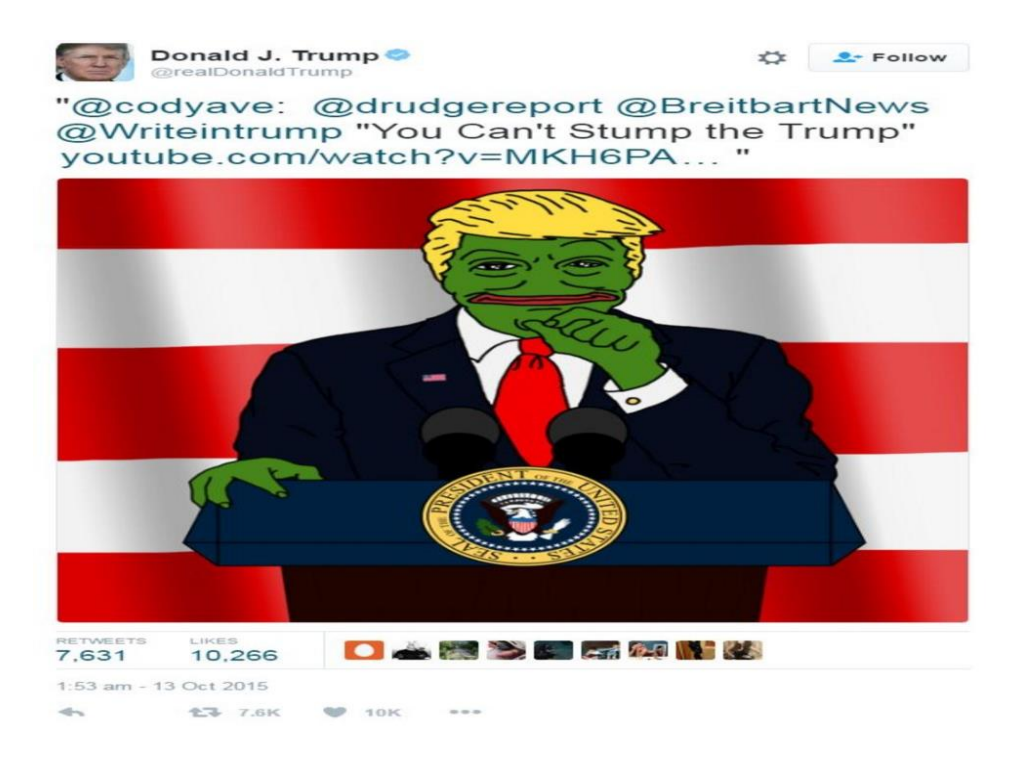
Figure 3 . Mr Trump re-tweeted a caricature depicting him as Pepe. BBC News, "You Can't Stump the Trump," October 2015, <a href="https://www.bbc.com/news/world-us-canada-39843468">https://www.bbc.com/news/world-us-canada-39843468</a>