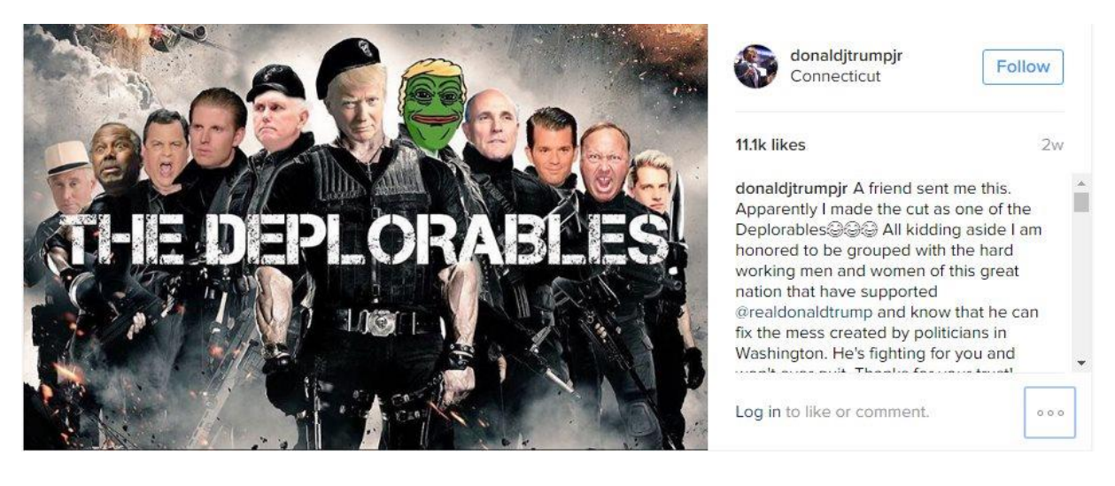
Figure 2. Alt-Right meme shared by Donald Trump Jr, "A friend send me this. Aparantly I made the cut as one of the Deplorables...," Instagram, September 10, 2016, <a href="http://www.instagram.com/p/BKMtdN5Bam5/">http://www.instagram.com/p/BKMtdN5Bam5/</a>.