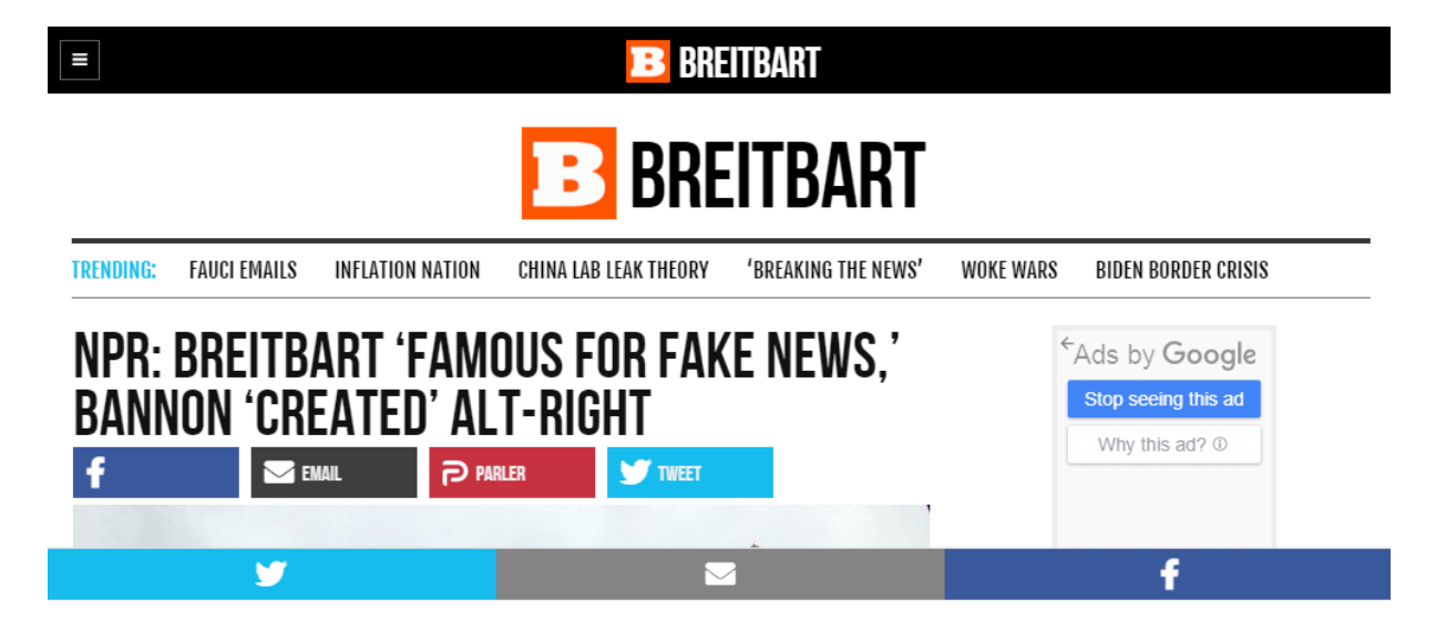
Figure 6 . "NPR: Breitbart 'Famous for Fake News,' Bannon 'Created' Alt-Right," accessed in July 5, 2021,