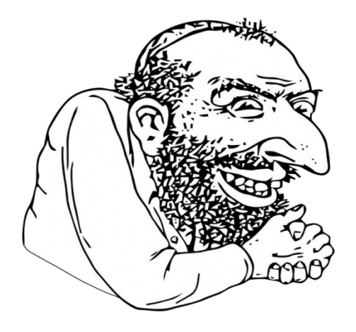
Figure 5. "Le Happy Merchant Meme," PNGitem, accessed in June 9, 2021,

The Happy Merchant is an anti-Semitic meme depicting a drawing Jewish man rubbing his hands together and smiling. The image was drawn by a racist cartononist who used the pseudonym "A. Wyatt Mann," exposed in 2015 as actually being artist Nick Bougas (Mulhall et all, 2017, p.27). It is used for the purpose of dehumanizing the Jew as a type of evil monster, rather than a human being. It became the most popular memes on both 4chan and Gab, two major outlets for Alt-Right expression (Anglin, 2016, par.20) (see Figure 5 )