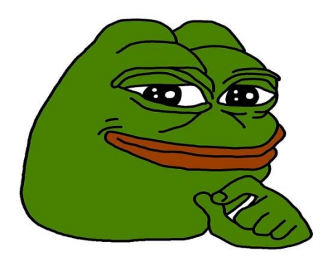
Figure 1 . Pepe the Frog. Antonia Cundy, "Is Pepe the Frog really a hate symbole?" November 2, 2016, <a href="https://www.prospectmagazine.co.uk/world/pepe-the-frog-hate-symbol-alt-right-donald-trump">https://www.prospectmagazine.co.uk/world/pepe-the-frog-hate-symbol-alt-right-donald-trump</a>

election, the Alt-Right altered the poster for the movie The Expendables to show Trump and his advisors, featuring Pepe (see Figure 2 ) (Roy, 2016, par.6)