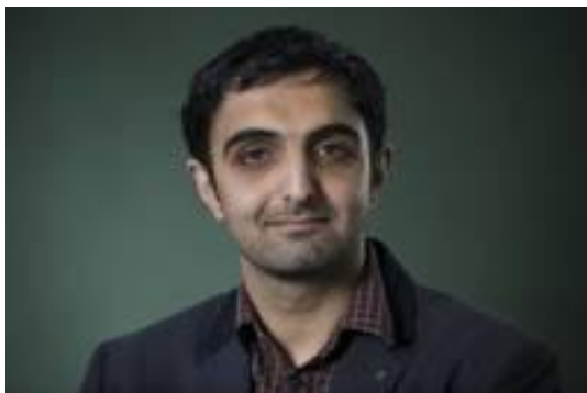
Figure 1. His second novel, The Year of the Runaways , about the experience of illegal immigrants in Britain, was published in June 2015.