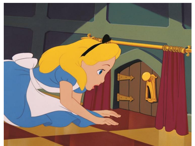
Fig.4 Alice and the doorknob. Alice in Wonderland (1951).