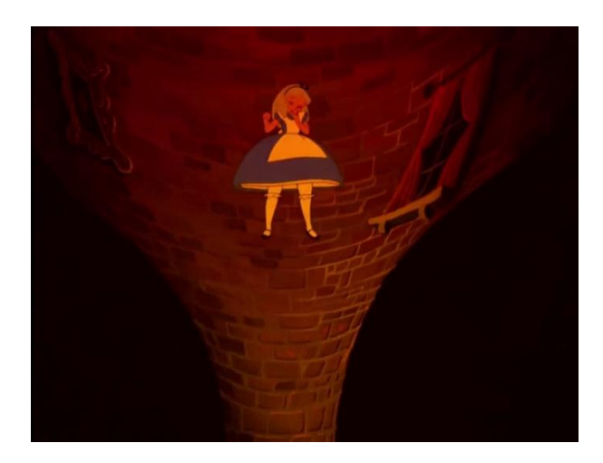
Fig.3 Alice falling in the rabbit hole. Alice in Wonderland (1951).