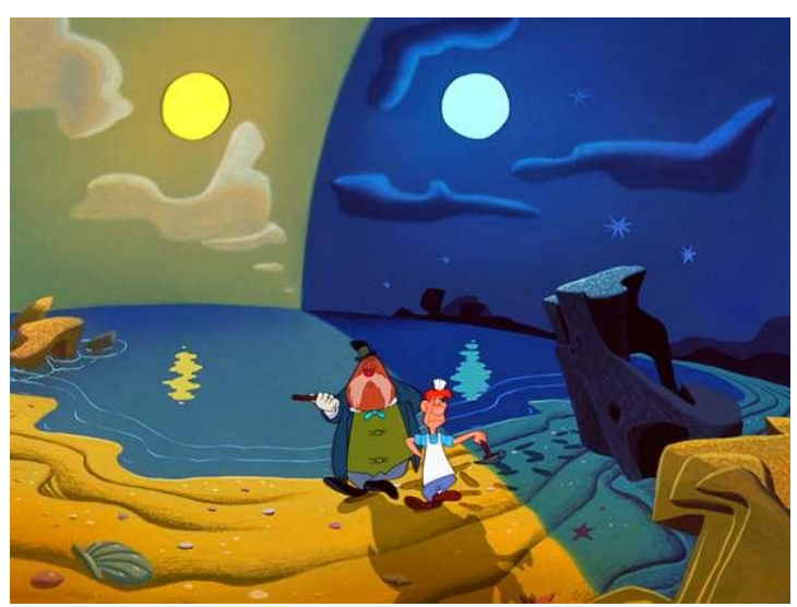
Fig.6 The tale of Walrus and the Carpenter. Alice in Wonderland (1951).