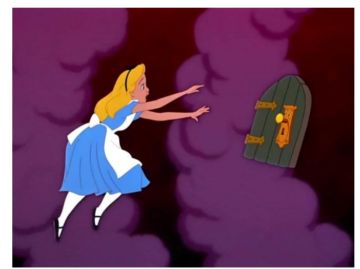
Fig.13 Alice running towards the door. Alice in Wonderland (1951).