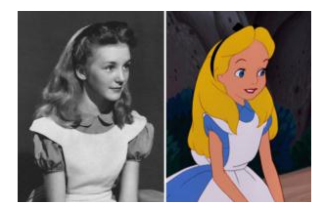
Fig.2 Kathryn Beaumont. Kathryn Beaumont modelling for Alice (1951)