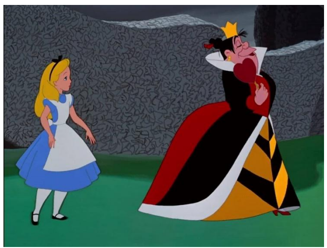
Fig.12 Alice with the queen of hearts. Alice in Wonderland (1951).