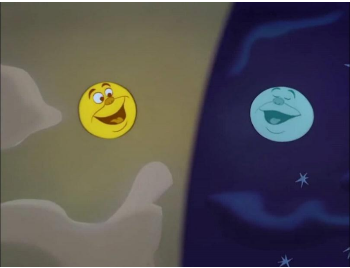
Fig.5 Tweedledee and Tweedledum. Alice in Wonderland (1951).