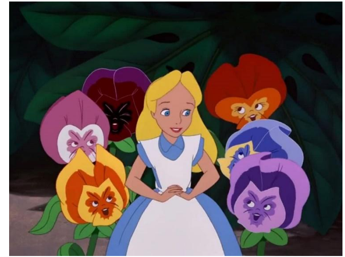
Fig.7 The golden afternoon song. Alice in Wonderland (1951).