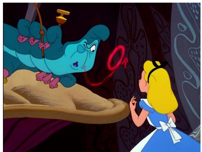
Fig.8 Alice and the Caterpillar. Alice in Wonderland (1951).