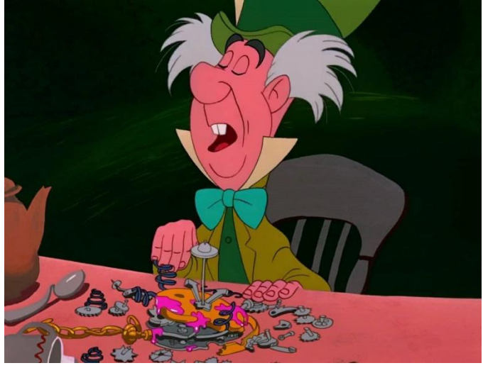
Fig.10 The Madhatter. Alice in Wonderland (1951)