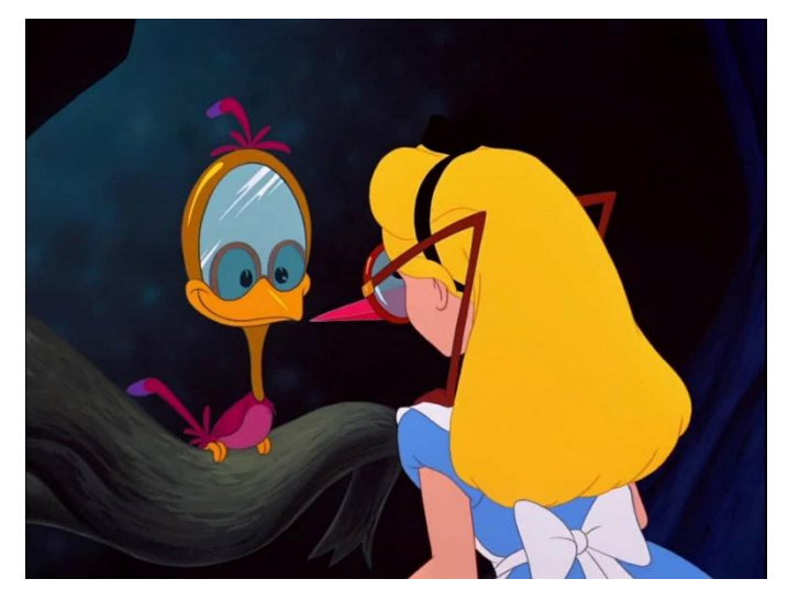
Fig.11 Alice in the wood. Alice in Wonderland (1951)