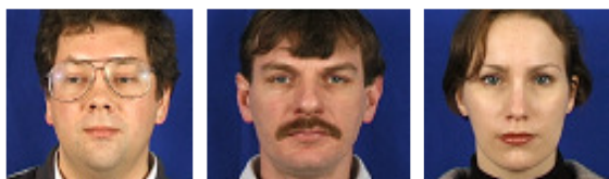
Fig 1. Sample images from XM2VTS database[5]

Our experiments were performed on frontal face images from the XM2VTS database[5][6]. The XM2VTS database is a multimodal database consisting of face images, video sequences and speech recordings taken of 295 subjects at one month intervals. The database is primarily intended for research and development of personal identity verification systems. Since the data acquisition was distributed over a long period of time, significant variability of appearance of clients, e.g. changes of hair style, facial hair, shape and presence or absence of glasses.