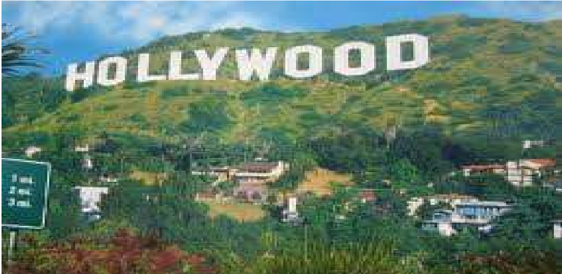
Logo 1: Hollywood

Hollywood is a district in Los Angeles, California. It is fame as the centre of the film industry studios.