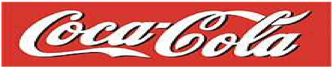
Logo 4: Coca Cola.

Coca-Cola is a carbonated soft drink sold in the stores, restaurants, and vending machines of almost all the world countries. “It is produced by The Coca-Cola Company of Atlanta, Georgia, and is often referred to simply as Coke (a registered trademark of The Coca-Cola Company in the United States since March 27, 1944)” (“Coca Cola Classics”). It means that Coca Cola is typically American product, and knew its foundation in America.