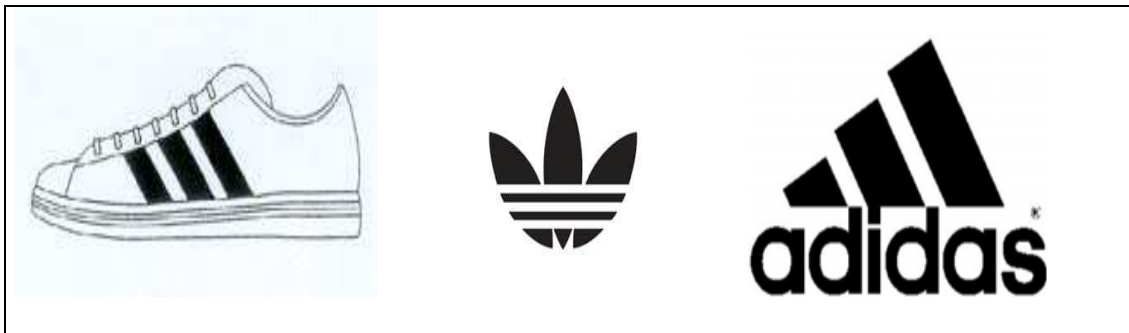
Logo 2: Adidas (Source: “adidas the history of logo” by adidas group.)