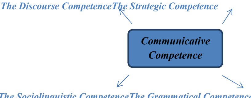
The Sociolinguistic CompetenceThe Grammatical Competence

The fowling figure summarizes the four components of the communicative competence approach.