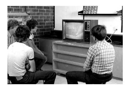
Figure 1. TV in use with a class in the 1970s (In Lee and Winzenried, 2009, p. 64)

According to Oxford learner's pocket Dictionary, Television is "pies of electrical equipment with a screen on which you can watch movies and sounds."