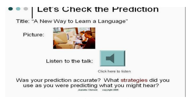
Figure 4: Pre-listening activity with link to accompanying audio

After listening, a short discussion raised about what you just heard and understand. Therefore, in using the radio in the way suggested, we allow learners access to native speakers language, something that might be absent from their normal classroom experiences.