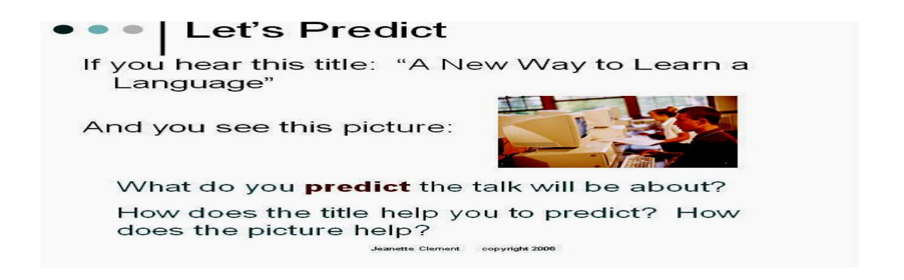
Figure 3: pre-listening activity for a listening –strategies lesson

It means that, in this phase teacher can initiate a short discussion with the learners, to know what they think of the topic before they listen to the text.