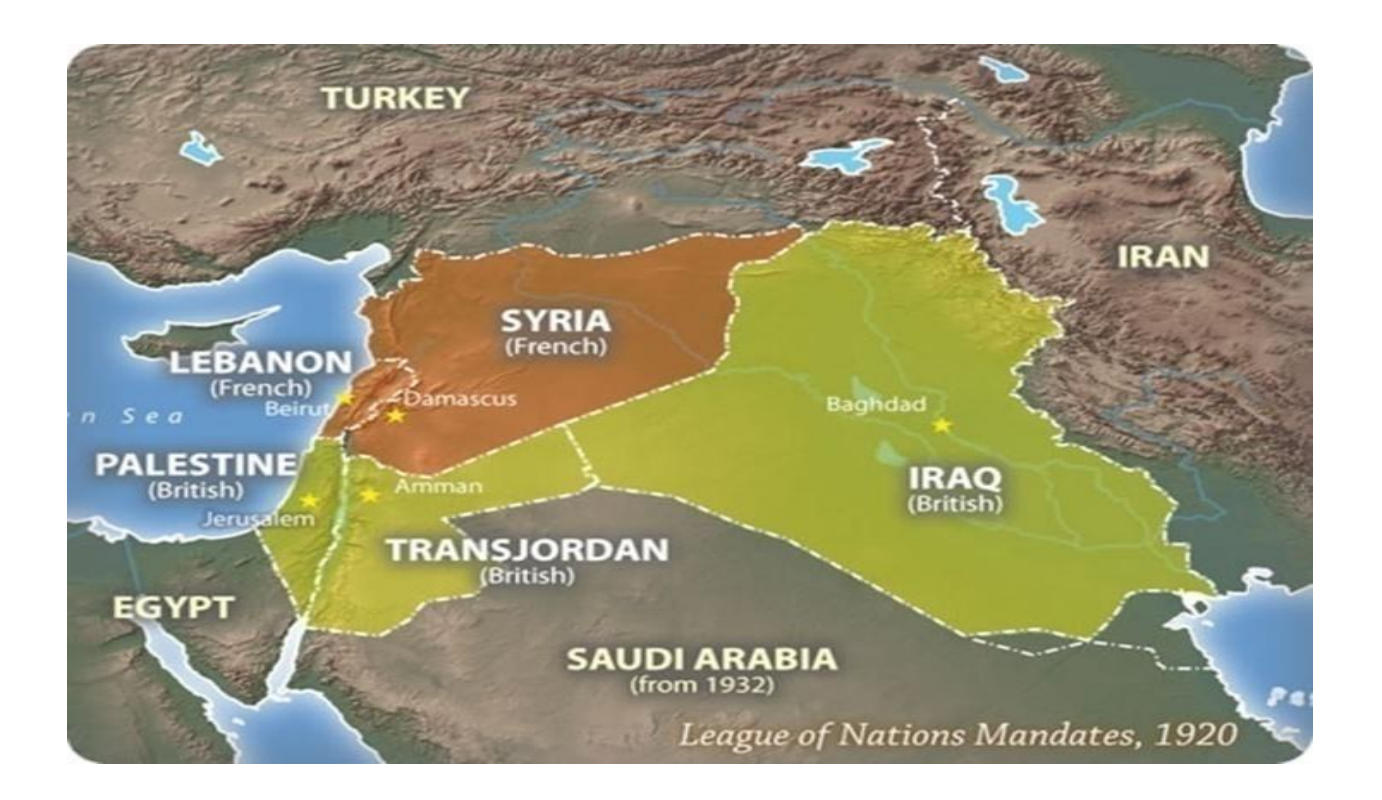
<u>Figure 02</u>: The division of the Ottoman provinces between France and Britain. Available at: <a href="http://lostislamichistory.com/the-decline-of-the-ottoman-empire-part-3-nationalism/">http://lostislamichistory.com/the-decline-of-the-ottoman-empire-part-3-nationalism/</a>>.

Transjordan, Syria, Iraq, Lebanon, and Palestine, and creating a new Jewish state named Israel.