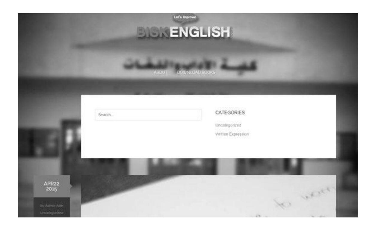
Figure 1: The blog's homepage

the blog has been updated, and it allows them to search the archives by keyword, by date, or by category.