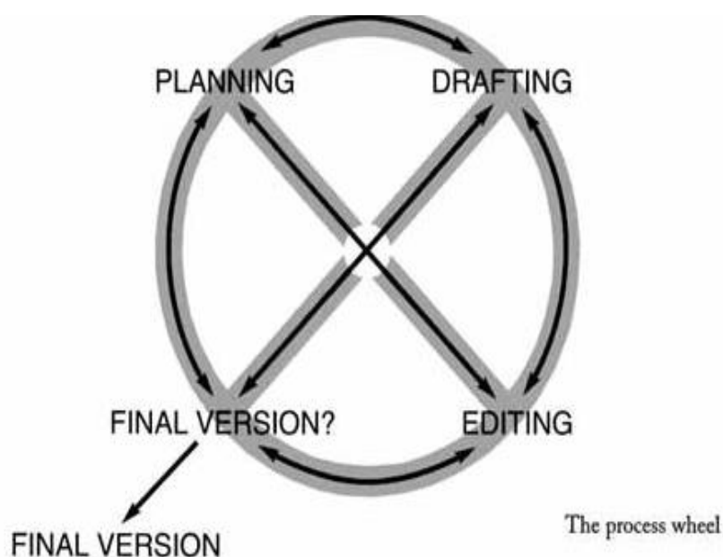
Figure: 2.3. The Process Wheel. (Harmer, 2004, p. 6)

According to Harmer (2004, p. 5), “the process of writing is recursive”. This means the writers plan, draft, and edit. Then, re-plan, re- draft, and re-edit. Harmer compares writing process to a “wheel”. Writers can move backwards and forwards only when the final product is reached as showed in the following wheel.